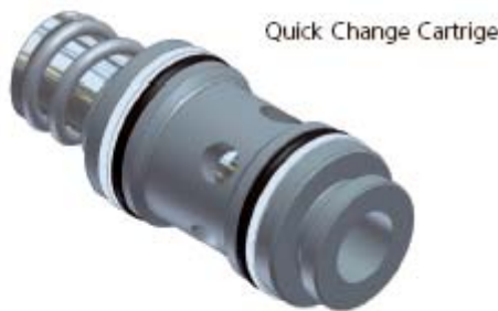
Quick Change Cartridge

KMT Aqua-Dyne offers a complete line of genuine KMT parts & accessories (seals, nozzles, hoses, Shape Jets & safety shrouds) to keep your pump running at top performance.