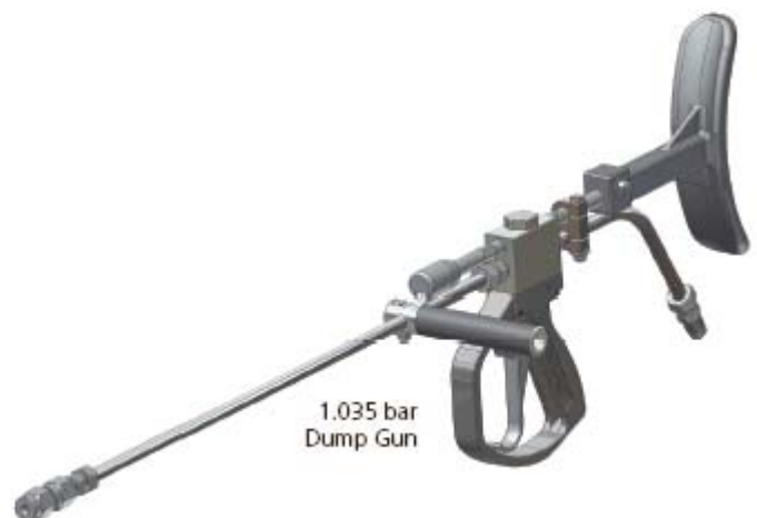
1.035 bar Dump Gun