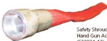
Safety Shroud Hand Gun Accessory (S20021-12)